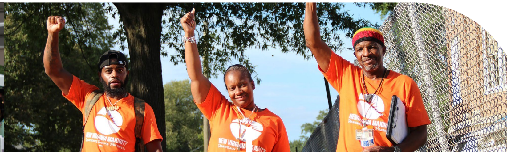
(quote source: https://assets.nationbuilder.com/newvirginiamajority/pages/3946/attachments/original/1671067492/2022_NVM_FOY_Impact_Report.pdf?1671067492 )